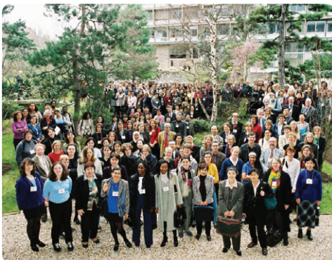
ICWIP 2002, March 3–9, 2002, Paris, France

The Working Group planned a three day International Conference on Women in Physics, which was held at UNESCO Headquarters in Paris, France on March 7 to 9, 2002.