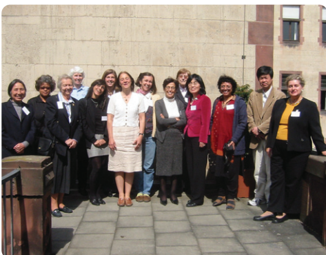
IUPAP WGWiP Meeting, April 22–24, Bad Honnef, Germany

tus of women in physics in their home countries. The outcomes of this conference were presented at the IUPAP General Assembly in October 2002, where most of the resolutions were approved.