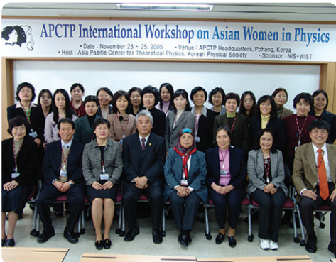
The International Workshop on Asian Women in Physics in Pohang, Korea (November, 2005).