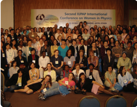
ICWIP 2005, May 23–25, 2005, Rio de Janeiro, Brazil